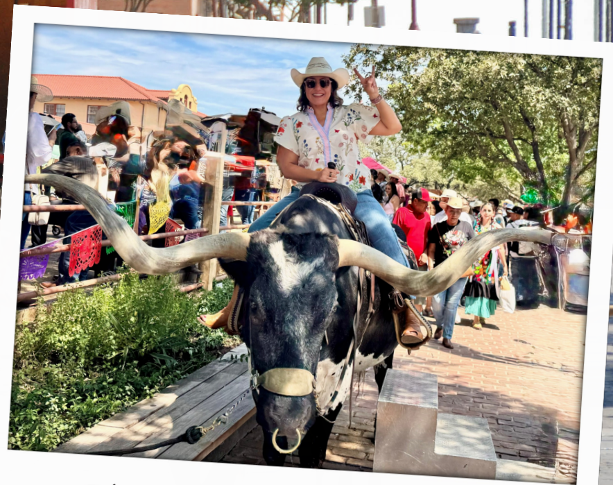
Ft. Worth, TX