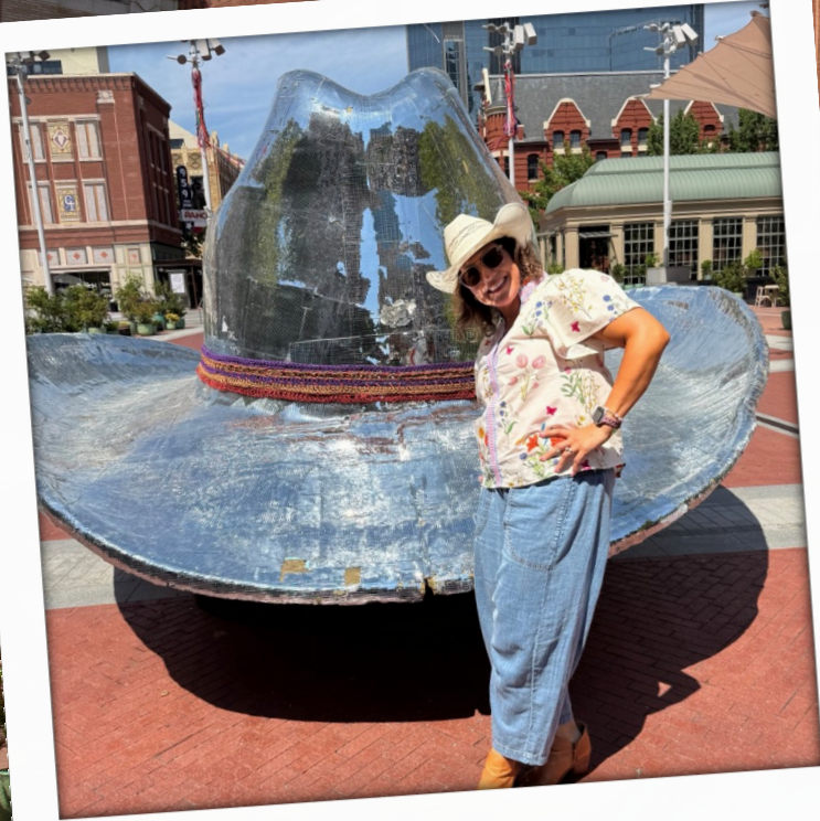
Ft. Worth, TX