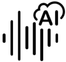
Hosted IVR Systems